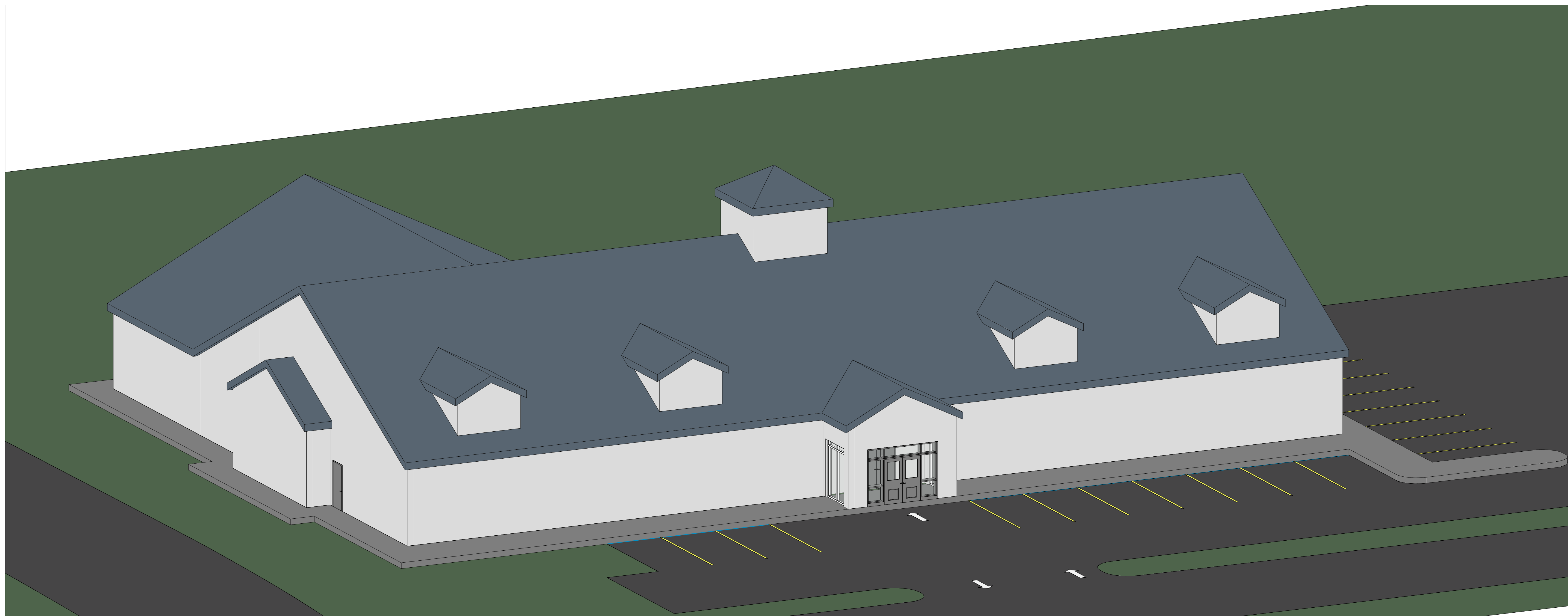
2 FRONT OPTION 2 PRES-22