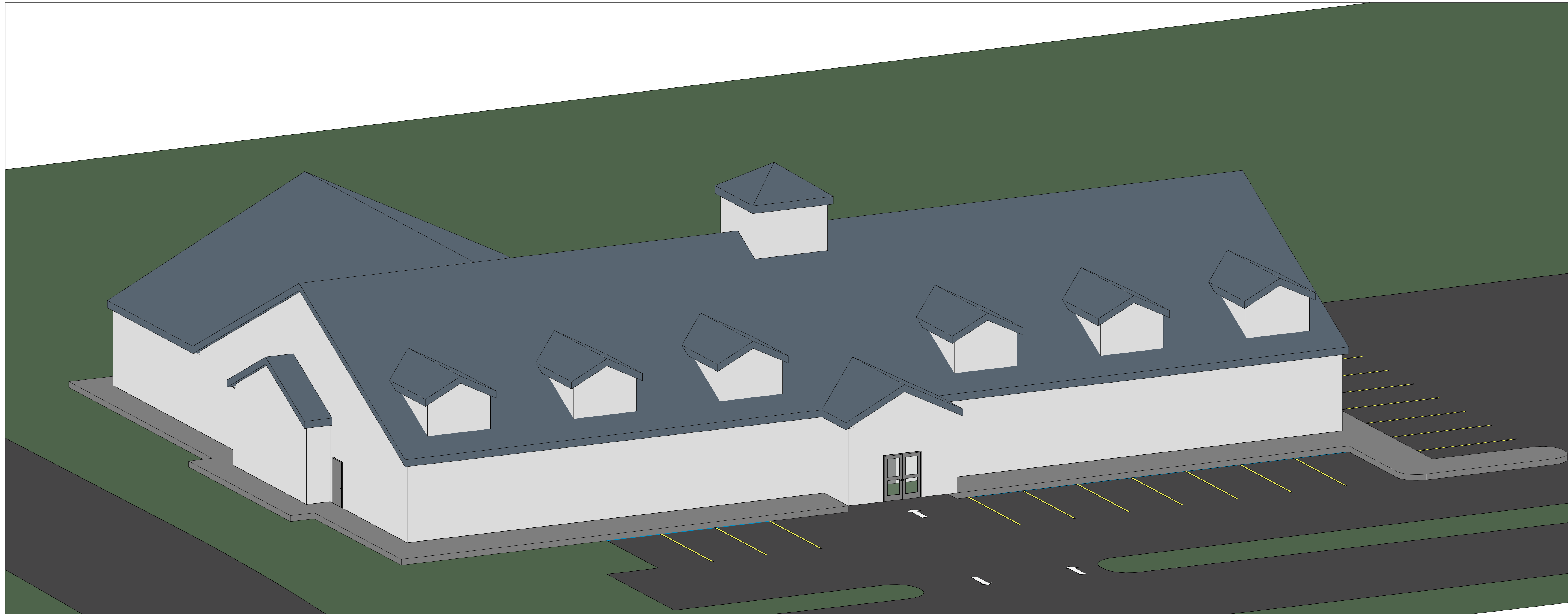
1 FRONT OPTION 1 PRES-22