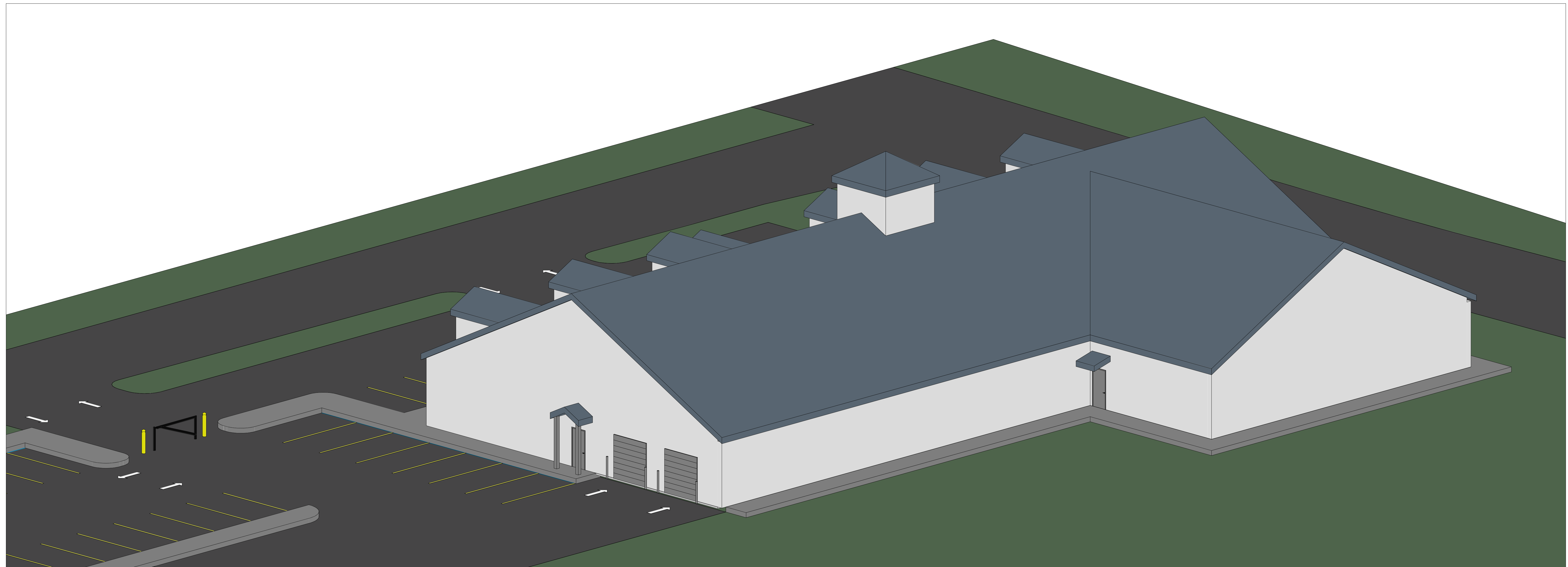
2 BACK VIEW - ALL OPTIONS PRES-7