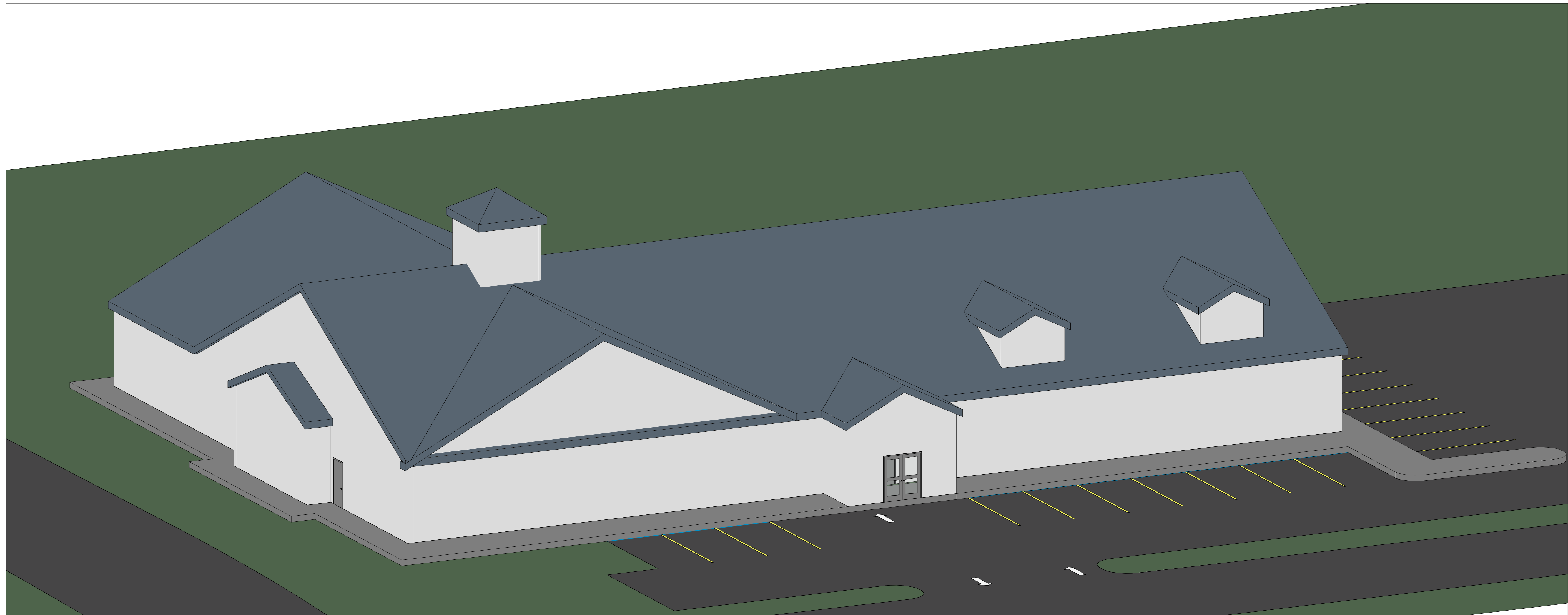
1 FRONT OPTION 3 PRES-7