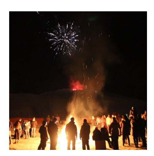
Abenaki Ski Area celebrated its 80th season in 2016. The Fireworks were spectacular!

The Abenaki Winter Triathlon was a success this year despite having to alter the course. Our Progressive XC Ski Dinner sold out a month ahead of time and we had 58 people on the waiting list.