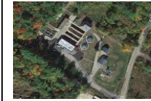
(ii) Treatment Plant & Garage