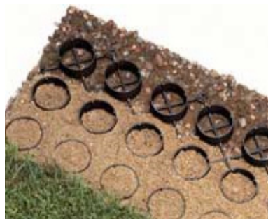
Schematic of the Invisible Structures Grasspave2 plastic grid system (invisiblestructures.com)

Plastic grid systems are not intended for high-traffic surfaces, or frequent use by heavy weight vehicles where the grids may become worn down or over-compacted. Mowing and otherwise maintaining the turf in your grid system is important to ensure continued high function. Care should be taken when applying deicers in the winter to avoid killing grasses.