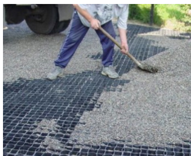
Installation of a plastic grid system with gravel fill (groundprotection.co.uk)