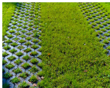
Concrete paver driveway planted with turf.