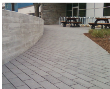
A concrete paver walkway in Burlington.

Some site preparation, such as clearing and leveling, is necessary to ensure that the pavers are installed evenly and correctly and won’t “pop”. Care should be taken when applying deicers to vegetated pavers in the winter.